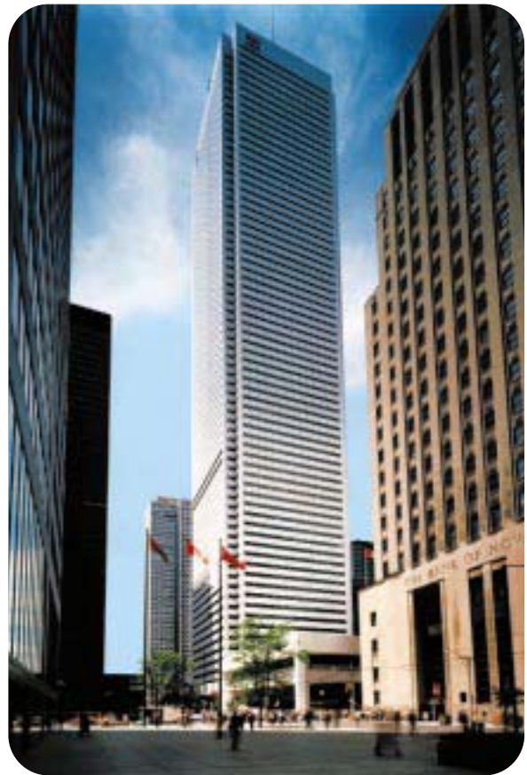
First Canadian Place

In some ways, First Canadian Place, the 72-story office and retail complex that's the lifeblood of Toronto's financial district, is like a small city. On any given work day, as many as 300,000 people pass through the doors of Canada's tallest building. So the owners of the property, when they set out to upgrade the 3.4 million square-foot complex, wanted the best and most technologically advanced fire detection and alarm system. The engineer's specification also called for a system with the survivability to withstand a catastrophic event such as the World Trade Center disaster. In this extremely challenging retrofit project, Simplex was able to meet each and every requirement and fulfill the customer's vision for a state-of-the-art fire detection system.